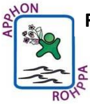
Figure 2: Management of Iron Deficiency Anemia (IDA) (APHON/ROHPPA)